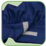
Adjustable velcro closure