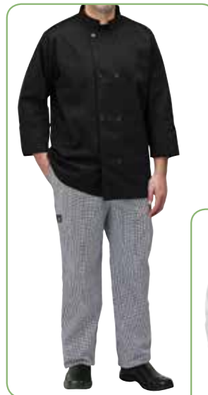
UNF-5KL Chef Jacket UNF-4KL Houndstooth Pants