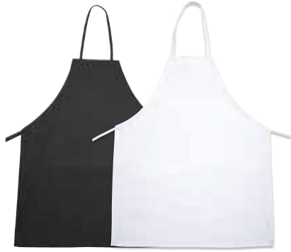
BA-SERIES WITHOUT POCKETS