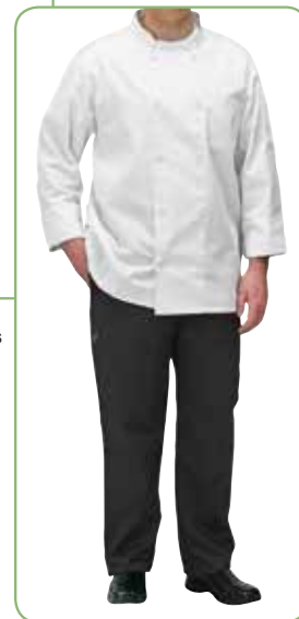
UNF-5WL Chef Jacket UNF-2KL Black Pants