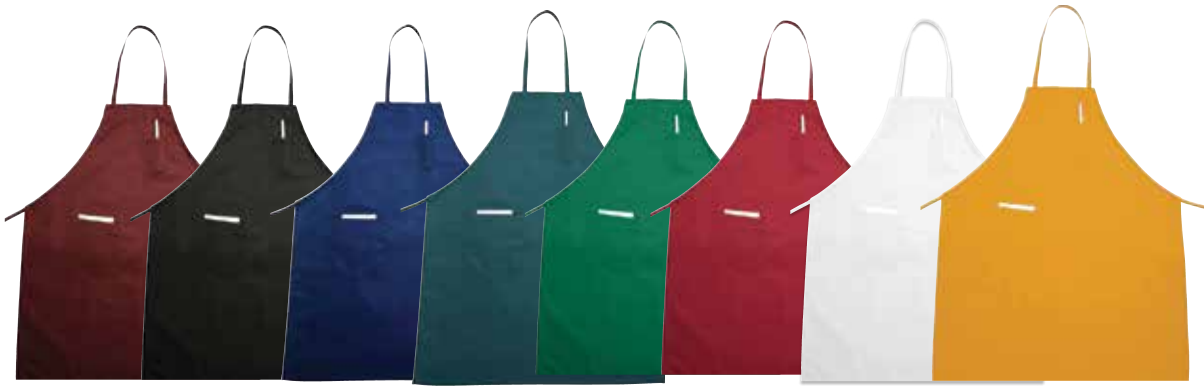
BA-SERIES W/ PEN & PAD POCKETS