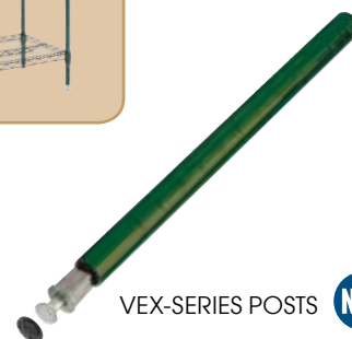
VEX-SERIES POSTS NSF

Customize the Epoxy Coated Wire Shelves to accommodate all of your storage needs