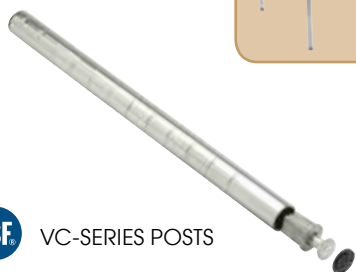
NSF VC-SERIES POSTS

Customize the Chrome-Plated Wire Shelves to accommodate all of your storage needs