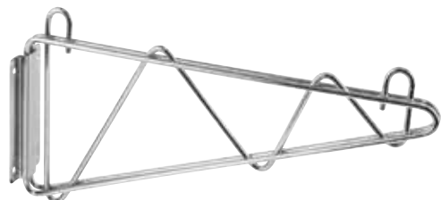
VCB-SERIES WALL MOUNT BRACKET