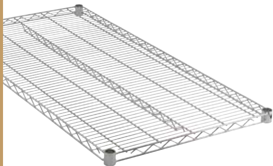
NSF VC-SERIES SHELVES