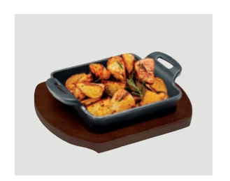
CASM-4SUL with CAST-4S