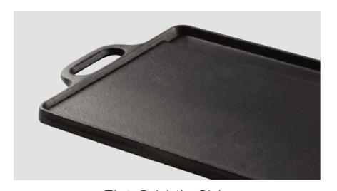
Flat Griddle Side