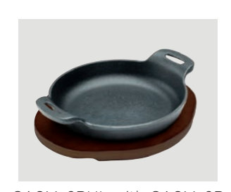
CASM-6RUL with CASM-6R