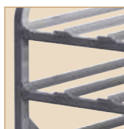
Tiers slant forward and raised edges prevent cans from rolling out