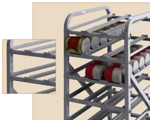
Tiers slant forward and raised edges prevent cans from rolling out