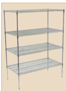
NSF VC-SERIES SHELVES