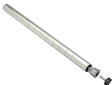
NSF VC-SERIES POSTS

Customize wire shelving to fit a variety of dry storage needs