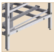
Reinforced frame, stainless steel levelers