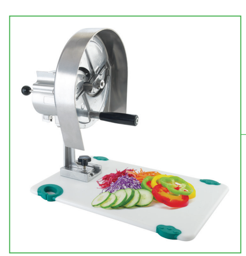
EVS-1 mounted to CBM-1218