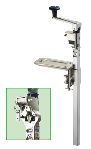
Includes base, blade, gear and installation kit